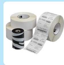
Consumables (labels, ribbons, PVC cards)